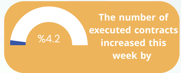
Table No. (1) Trading indicators in the Iraq Stock Exchange for the period from 3/5/2026 - 7/5/2026